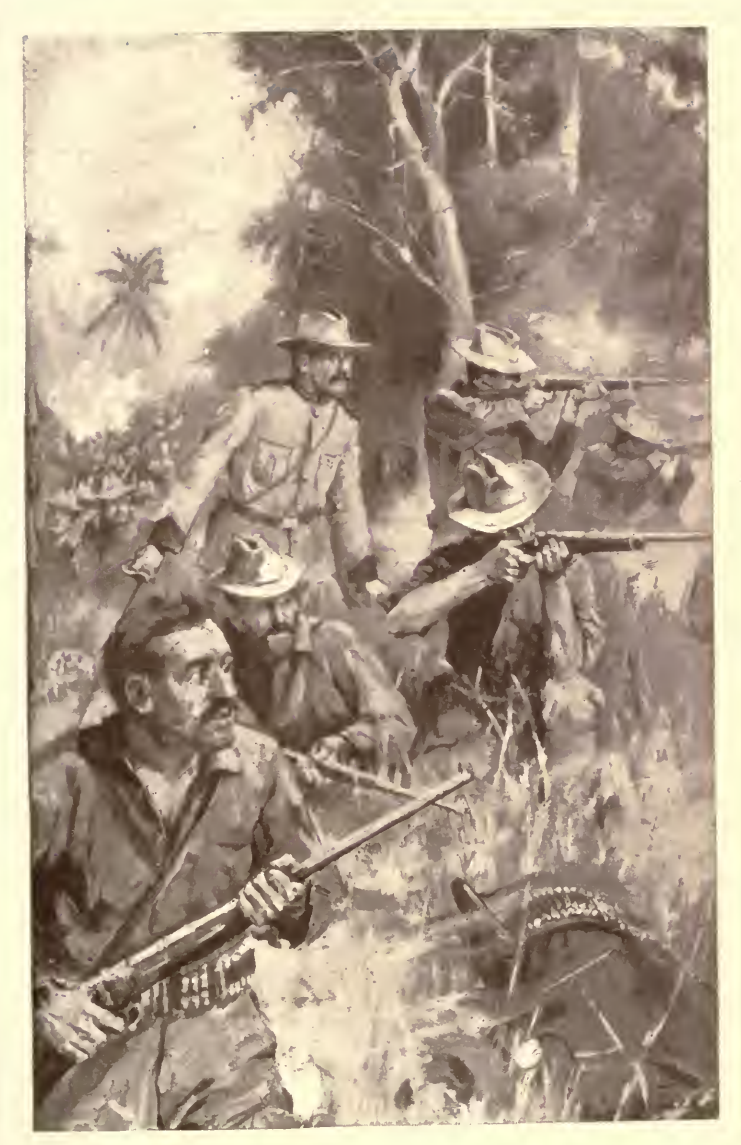
Roosevelt's Rough Riders in Action